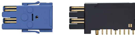
VTAC HSD Right Angle SIM Inserts